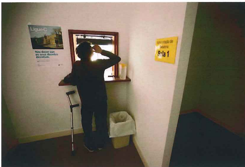
A patient drinks a dose of methadone at the Taipas rehabilitation clinic in Lisbon, Portugal

At the time, I was writing a book about the politics of drug prohibition. I started to ask Ehrlichman a series of earnest, wonky questions that he impatiently waved away. "You want to know what this was really all about?" he asked with the bluntness of a man who, after public disgrace and a stretch in federal prison, had little left to protect. "The Nixon campaign in 1968, and the Nixon White House after that, had two enemies: the antiwar left and black people. You understand what I'm saying? We knew we couldn't make it illegal to be either against the war or black, but by getting the public to associate the hippies with marijuana and blacks with heroin, and then criminalizing both heavily, we could disrupt those communities. We could arrest their leaders, raid their homes, break up their meetings, and vilify them night after night on the evening news. Did we know we were lying about the drugs? Of course we did."