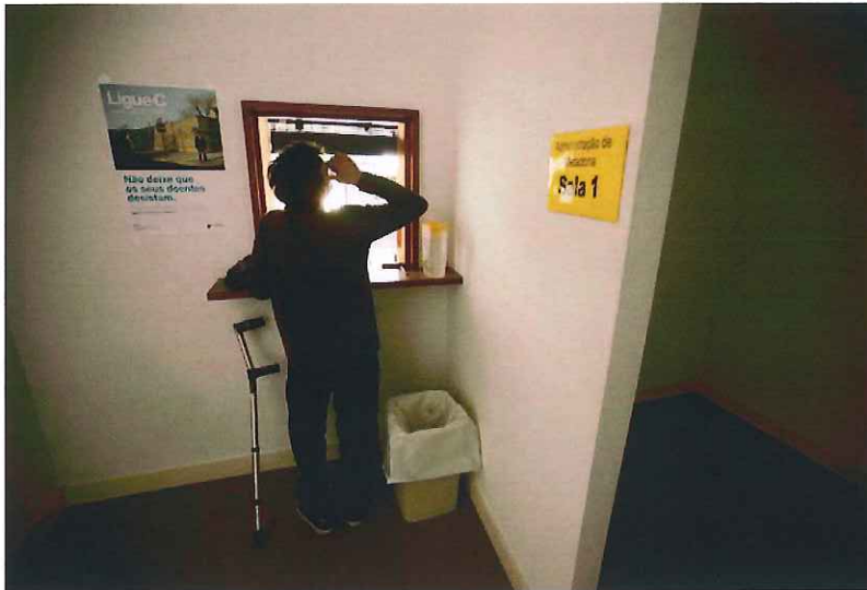
A patient drinks a dose of methadone at the Taipas rehabilitation clinic in Lisbon, Portugal

At the time, I was writing a book about the politics of drug prohibition. I started to ask Ehrlichman a series of earnest, wonky questions that he impatiently waved away. "You want to know what this was really all about?" he asked with the bluntness of a man who, after public disgrace and a stretch in federal prison, had little left to protect. "The Nixon campaign in 1968, and the Nixon White House after that, had two enemies: the antiwar left and black people. You understand what I'm saying? We knew we couldn't make it illegal to be either against the war or black, but by getting the public to associate the hippies with marijuana and blacks with heroin, and then criminalizing both heavily, we could disrupt those communities. We could arrest their leaders, raid their homes, break up their meetings, and vilify them night after night on the evening news. Did we know we were lying about the drugs? Of course we did."